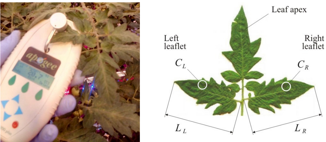
Fig. 2. Measurement of chlorophyll content index in leaf with CCM-200 (left) and bilateral traits of tomato leaf (right)

The lengths of the leaflets were determined using a transparent measuring ruler (the division value is 1 mm), laying it on a leaf along the vein of leaflets. The results were recorded with an accuracy of 0.5 mm. For non-destructive determination of chlorophyll a Chlorophyll Content Meter CCM-200 was used (Fig. 2).