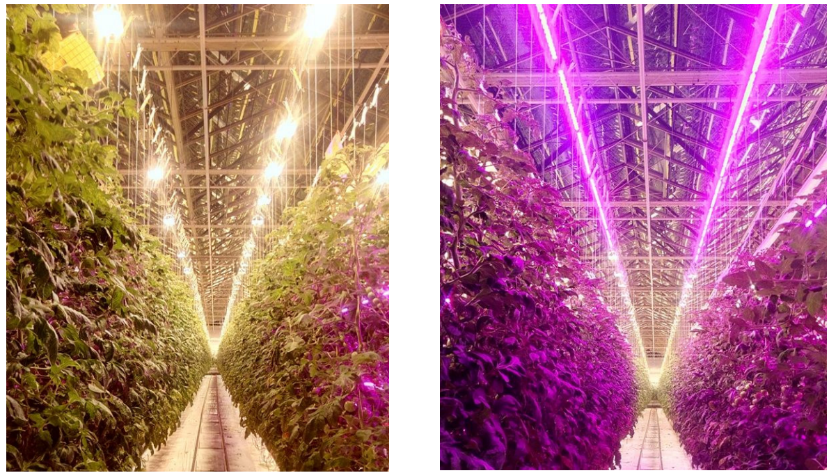
Fig. 1. Tomato plants in greenhouse under HPS (left) and LED (right) sources

Two bilateral traits were subjected to statistical analysis: I) the lengths of the liflets, first from the apex of leaves of a complex leaf of tomato on the left and on the right L_L and L_R ); II) the content of chlorophyll in them ( C_L and C_R ).